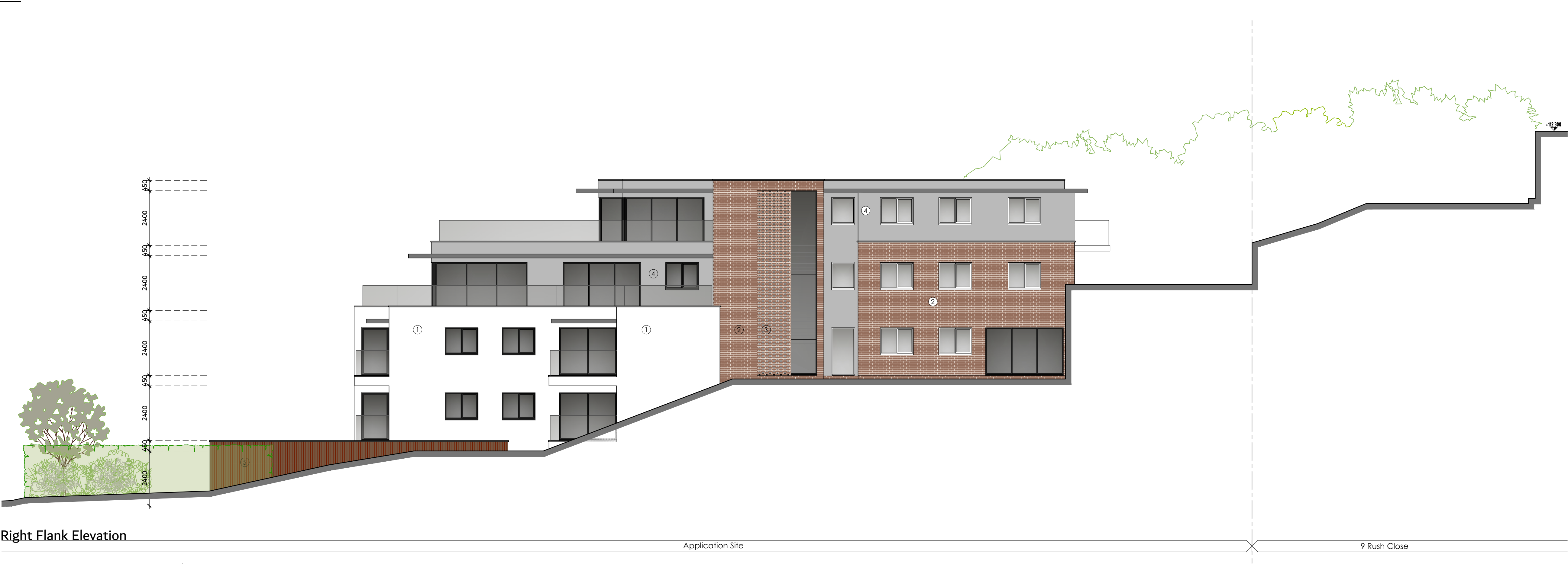
Right Flank Elevation