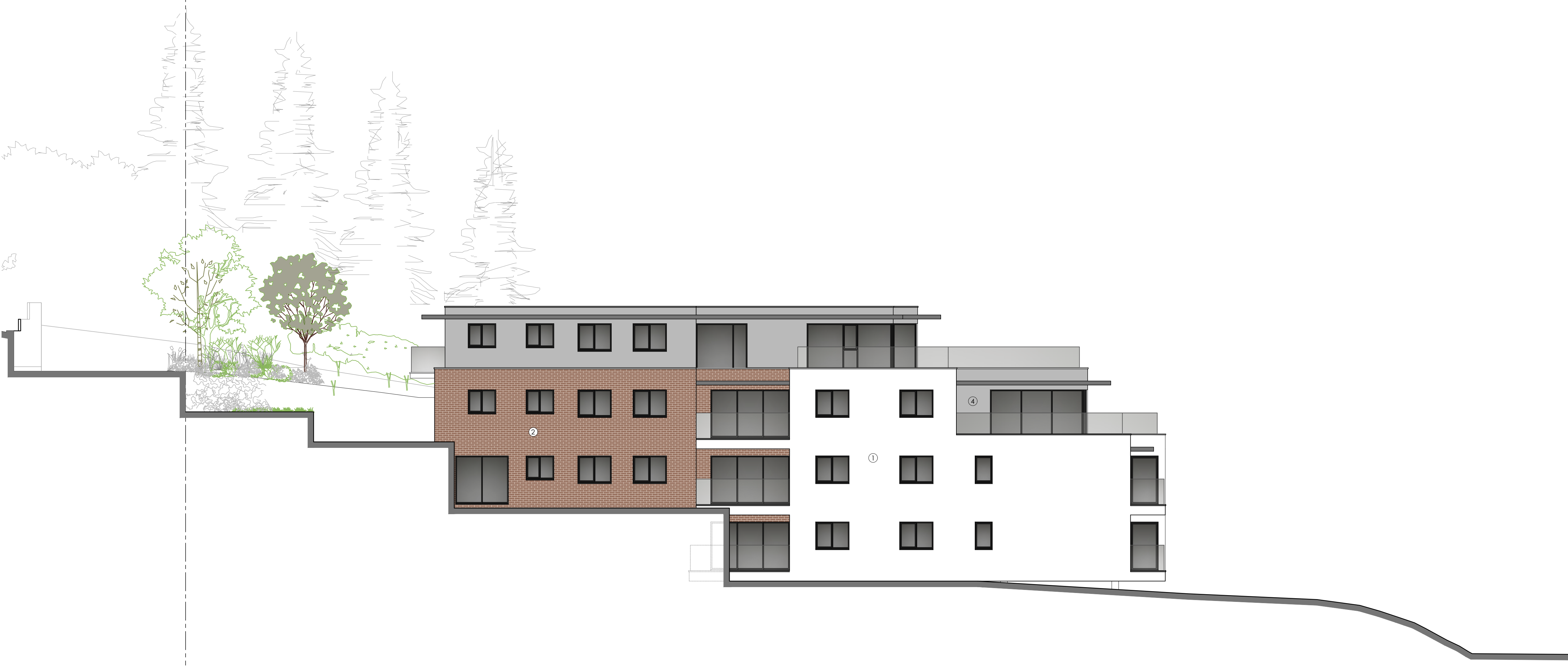
Left Flank Elevation

The copyright of this drawing remains the property of The Cohen Group Limited and it may not be reproduced without the express permission of The Cohen Group Limited.