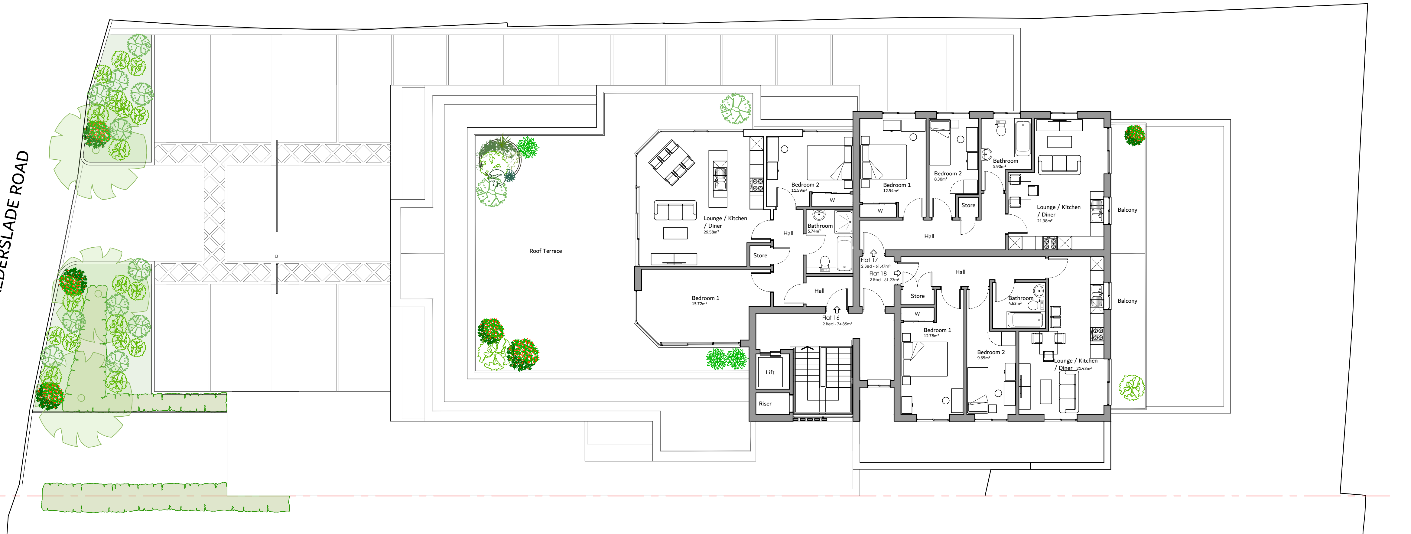
Fourth Floor Plan